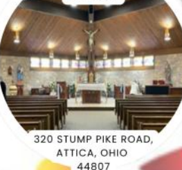
OUR LADY OF HOPE CATHOLIC CHURCH

4106 STATE ROUTE 269, BELLEVUE, OHIO 44811