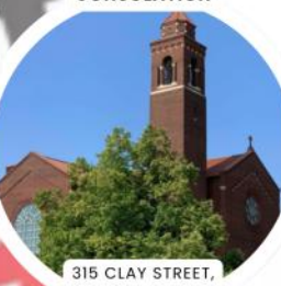
THE BASILICA AND NATIONAL SHRINE OF OUR LADY OF CONSOLATION