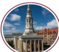
St. Peter in Chains