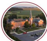
Maria Stein Shrine